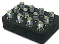
12 ID Only Coax Remotes