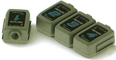
TCC200 includes 4 remotes. TCC200 includes 2 remotes.