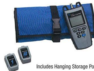
Includes Hanging Storage Pouch